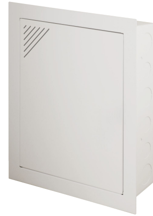
Flush mounted type